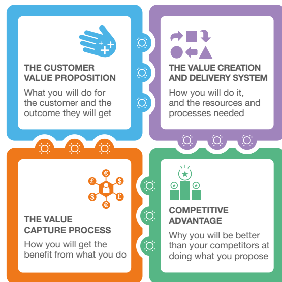
Figure 2: The structure of a digitally-enabled services business model

To get this, they need to collect, store and analyze this data, see emerging trends and interpret how these relate to opportunities to design new services. Only then can they plan how their expertise and product(s) can better support the customer.